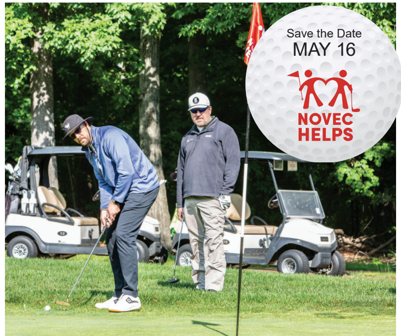
Golfers putting on the green at the 2023 NOVEC HELPS Golf Tournament.

NOVEC HELPS will donate proceeds from the tournament to charitable organizations throughout the community.